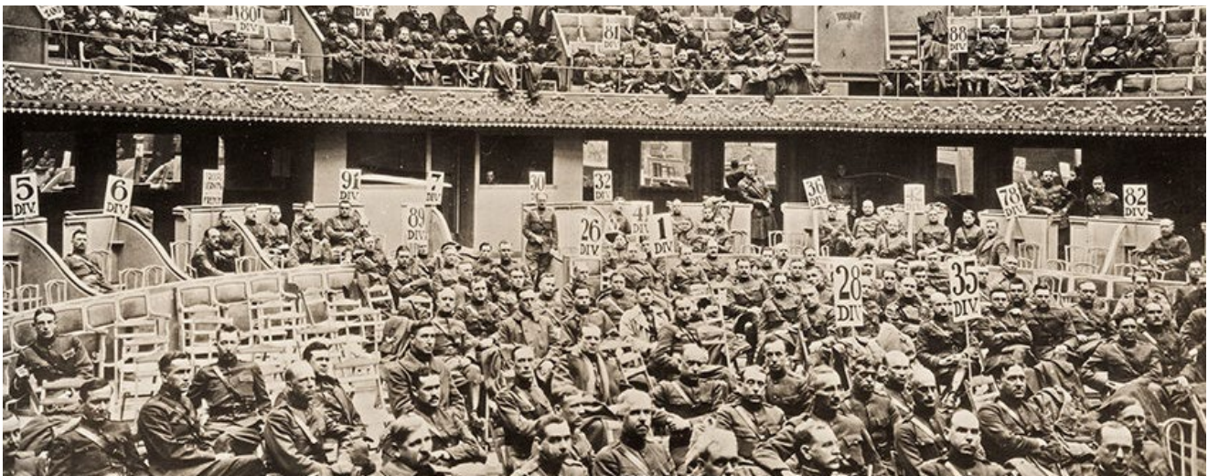
The Paris Caucus

On July 15, 1919, after many World War I veterans returned to civilian life, a group of them met in Utica to form a local post. After approval of the application on Aug. 20, 1919, Utica Post 229 became a reality.