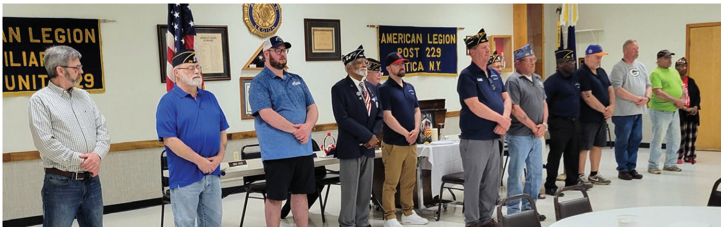
The May membership meeting featured the installation of officers for the Post and for the Sons of the American Legion squadron. BELOW: Notre Dame NJROTC cadets present the colors.