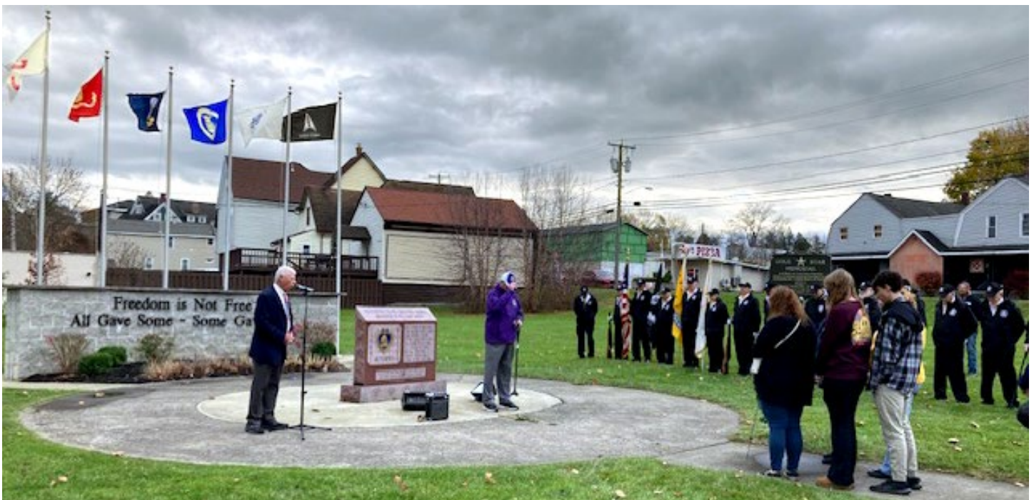
Utica Post 229 conducted Veterans' Day ceremonies at multiple monuments around the City of Utica, including Purple Heart Park in West Utica shown here.

EDITOR: ROBERT STRONACH. SEND NEWS, ANNOUNCEMENTS AND PHOTOS TO FIRSTCALL@UTICAPOST229.ORG .