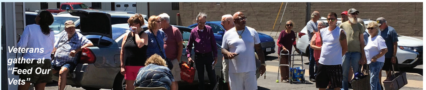
Veterans gather at "Feed Our Vets".

It's often not easy with the same individuals donating time and talents. Yet, time and again they rise to the occasion meeting our community needs. Let's get together and participate!